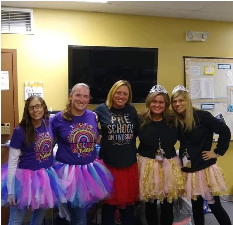
Staff at Central Christian on 2/2/22 day!!

In September 2021, Community Action Head Start opened at a new location. Central Christian center is located at 713 Riverside Dr. Currently there are 2 preschool classrooms operating in the building, with 7 staff. Two of the staff received their CDA through the Pathway program and another is now working on her CDA, hoping to be done by the end of summer.